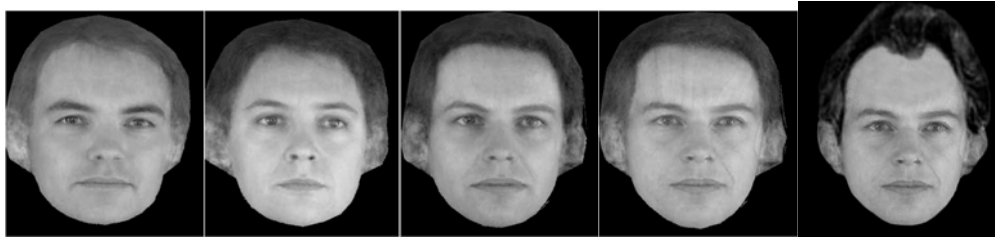
Figure 2: SMM human trial for famous face from memory: a) Starting face, b) and c) are intermediate points in the evolutionary process, d) final generated composite after 23 iterations (138 faces viewed), e) addition of hair to facial composite.

Frowd, Hancock and Carson (2004) found that naïve judges could name 10% of Evo-fit composites of celebrities produced from memory, compared to 17% of composites produced by an E-fit operator. The poorer performance of Evo-fit could have been attributable to the age range of the celebrities being inappropriate to the database used to generate the PCA space for Evo-fit. The age range of celebrities was appropriately restricted in a second experiment, in which the target faces were visible during the production of the composite. The naming rate of Evo-fit composites was 25% under these conditions, which is similar to comparable data for E-fit.